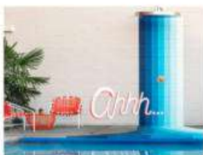
One of the mineral pools.