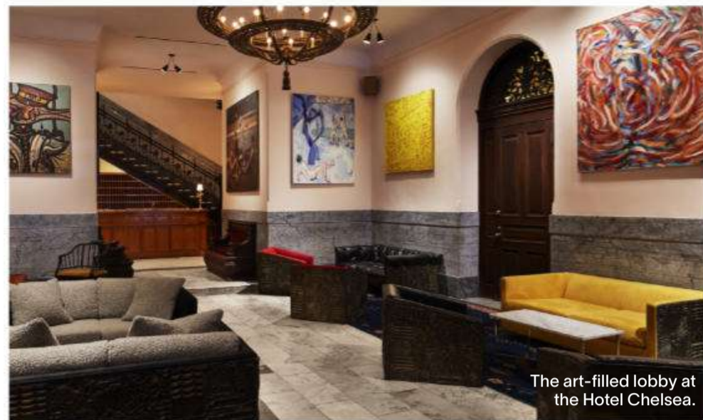
The art-filled lobby at the Hotel Chelsea.