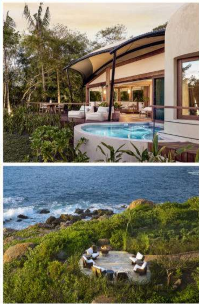
Above, from top: A camp-inspired villa; the best spot to catch sunsets. Left: The cocoonlike check-in area.

You could do that all day, but what makes Naviva truly unique is being able to create a bespoke well-being adventure. That could mean a core workout with a trainer at an outdoor gym where the weights are made of stone, à la The Flintstones , or a sunset sound-bath meditation. But the signature experience is the temescal sweat lodge, guided by a shaman who chants and splashes water on hot stones in a womblike structure in complete darkness. At the end of it, you're supposed to feel reborn. I did. At Naviva, there are several ways to leave feeling just like new. Villas from $3,950 —K. S.