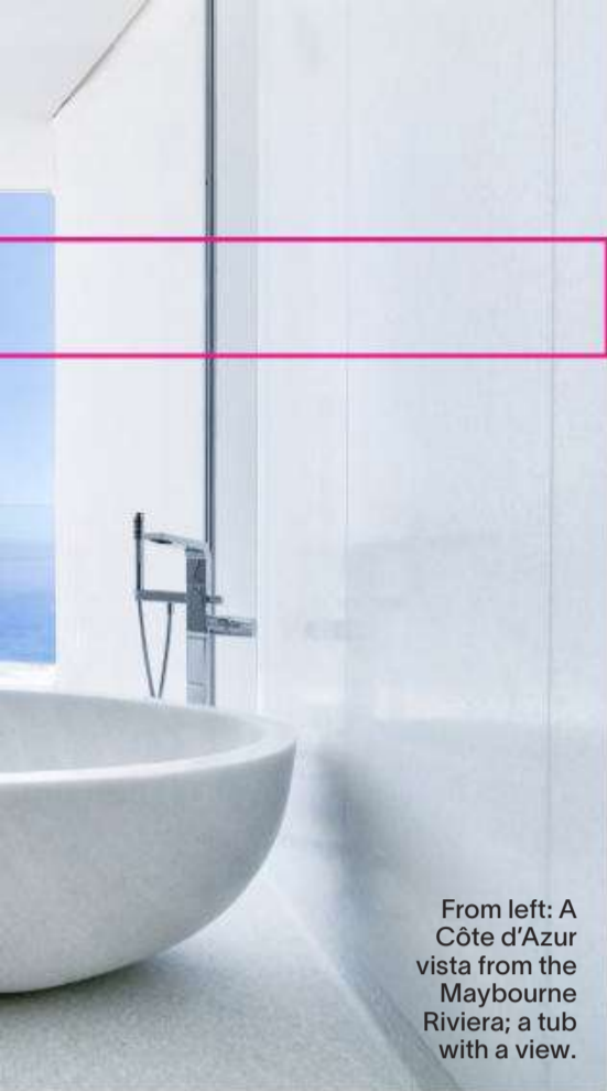
From left: A Côte d'Azur vista from the Maybourne Riviera; a tub with a view.