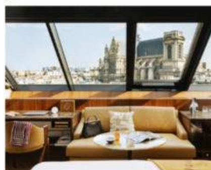
A room with a neighborhood view.

Tucked into the First Arrondissement, Hôtel Madame Rêve is all about the view—from your bed. Rêve means dream in English, after all. There are sixty-three bedrooms and nineteen suites; most wrap around the third floor of this former post office. If your room faces the neighborhood, it'll feature large, sloped, skylightlike windows that stretch the entirety of the space, making you feel as if you're on a Paris rooftop. Otherwise you'll look out over the stunning garden. Done dreaming? Head to the rooftop bar and spot the Eiffel Tower and Notre-Dame over a drink. Despite the hotel's residential vibe, it's only steps from the Jardin des Tuileries and the Louvre. It's the type of scene that gives you the sense you belong there, and by Parisian standards, that's rare. Rooms from approx. $535 —Krista Jones