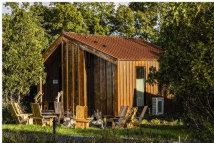
Live that firepit-and-cabin life at Wildflower Farms.

It's hard to imagine a more perfect escape from the madness of Manhattan than Wildflower Farms. It's luxe—lavish, actually—with sixty-five freestanding cabins, cottages, and suites dotting the property. Each has floor-to-ceiling windows and a patio that looks out at a sea of trees and, in some cases, the nearby Shawangunk Ridge. (Some also have outdoor showers.) Inside are comforting quilts splayed across big ol' beds and welcoming chairs. And there's a whole lot or little you can do on the property, depending on your mood. Plenty of ways to embrace farm life, with cooking, baking, and cocktail classes using produce from the grounds, plus muddier fare, like the daily farm sessions, which get visitors out into the rows of plants and the greenhouses. Or head out and feed the animals if you'd like! In the winter you can go ice climbing, and hiking is encouraged year-round. Of course, you can also do nothing. Lounge behind your cabin, or stroll over to the stunning main patio and... sit. It's wonderful! You'll get no judgment from us. Either way, the hotel's main building has a spa, which, no matter your speed, is a must-visit, and same goes for Clay, the New American restaurant serving breakfast, lunch, and dinner. Come hungry. Rooms from $1,000 — M. V.