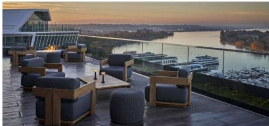
The Potomac as seen from Moonraker at the Pendry.