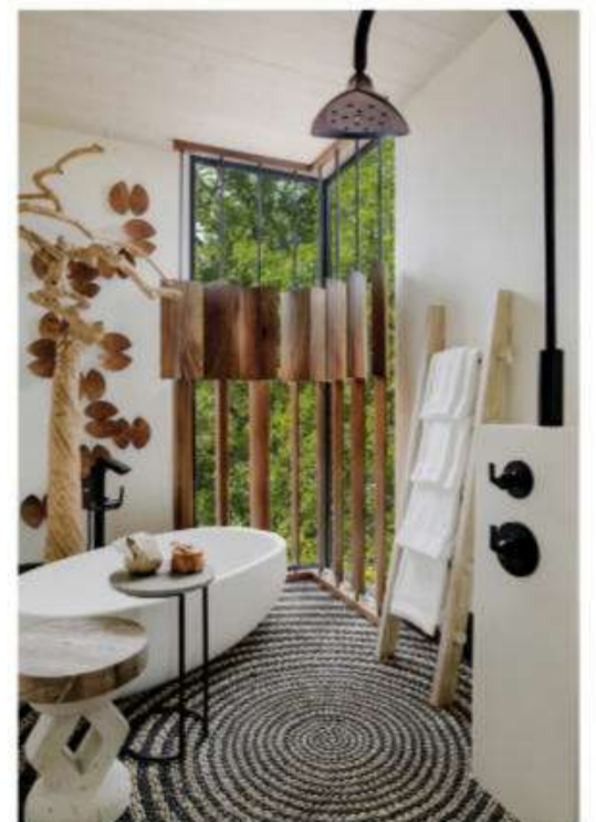
And the bathrooms are rad, too.