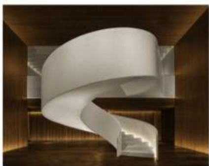
The signature modern staircase.

You might not be able to touch the art and furniture at the Prado, a short walk away, but you can here. The Madrid Edition is like an interactive MoMA or Pompidou playground where you can lounge on all the fantastically shaped exhibits. There's a blue pool table with a black-and-white nine-ball set and a white lamp, reminiscent of a kitchen vent, suspended over it in the lobby. There's a sweeping spiral staircase to greet you at one lobby entrance and a trademark neon-red floor-lit hallway at the other. But then you arrive in your room, all minimalist whites and beiges, complemented by a colossal bathroom with beige marble tiles, wrought-iron faucets, and knobs engineered to mechanical perfection. It'll put you on vacation even if you're on business. Rooms from approx. $480 — Jack Holmes