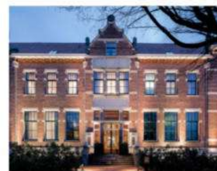
Pillows Maurits's early-1900s facade.

In this corner of Amsterdam, adjacent to Oosterpark, you might have college flashbacks as you climb the stairs of the brick building and encounter glazed yellow tiles on the walls, echoing early-1900s university style. But once you've been brought to the plush living room to check in, the energy switches—to elegant, boutique European luxury. The sumptuous rooms are as quiet as a vault. There's a sauna room you can rent by the hour for yourself. For a treat, visit VanOost, on the top floor, one of the most ambitious new restaurants in the city. For something a bit breezier, stop by Fitz's, a cozy, speakeasy-style bar that ranks among the city's best. Ask for a martini made with a Dutch gin and enjoy it by the Picasso print, the crown jewel of the building's art collection. Rooms from approx. $340 —K. S.