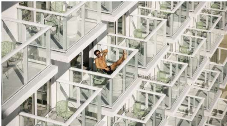
Balconies at the Arlo Wynwood.