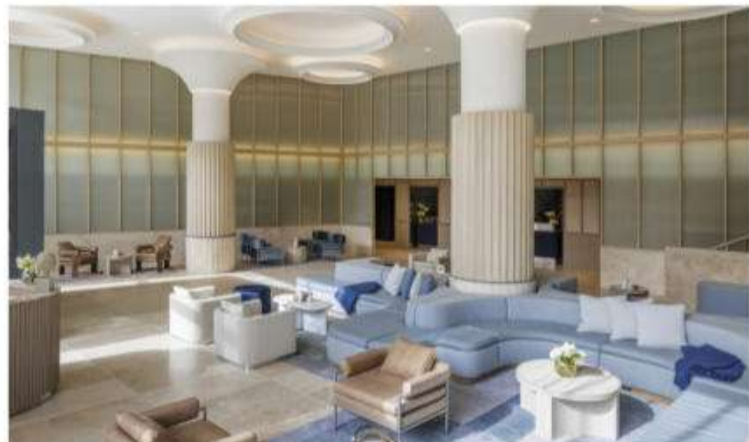
The soothing, curvaceous lobby of the Morrow in D. C.'s NoMa.