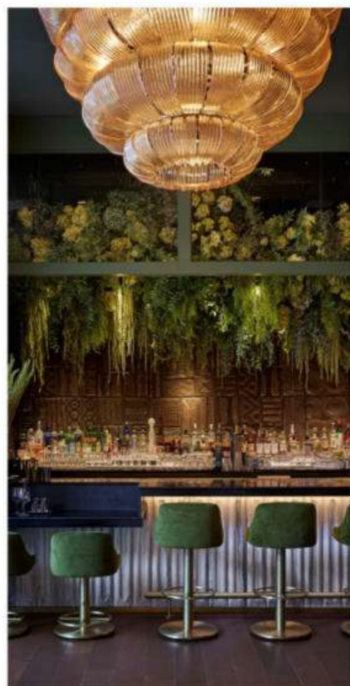
The lobby bar at the Ritz-Carlton New York, NoMad.

Lying in a cloudlike king bed, facing downtown, with One World Trade Center glimmering in the distance, I watched the sunset, thirty-four stories in the sky, and thought, What a thing to experience in a city where you thought you'd seen it all. As a gleaming, fifty-story-tall glass tower, the Ritz-Carlton New York NoMad offers that Ritz-Carlton tranquility, but the bars and restaurants here have made it an unlikely nightlife destination in a decidedly non-touristy hood. You'll have a sanctuary in your room with a tub—rare in N. Y. C.—but there's also a buzzy lobby bar and the José Andrés rooftop lounge Nubeluz. It's an uncommon New York hotel combo, where you can be serene or all-out energetic. Rooms from $1,000 —K. S.